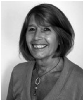
Joyce Dunbar Children's author.

Peace At Last!! I know it's one of mine but it really is fun to read aloud, especially the snoring bit. I also love Little Rabbit FooFoo and Revolting Rhymes for older kids – a joy to read aloud. I especially like Goldilocks which makes me laugh every time.