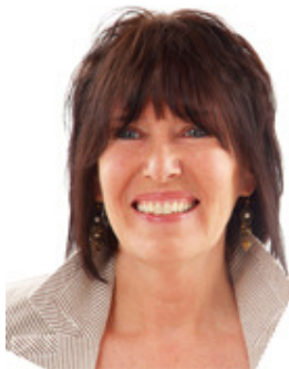
Jill Murphy Children's author

I loved sharing The House at Pooh Corner with my children, but they particularly liked Dinosaurs and All That Rubbish and a wonderful book of simple rhymes called Father Fox's Penny Rhymes .