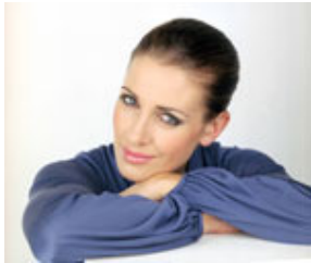
Kirsty Gallacher Presenter

I actually think that you can make a children's book that's wonderful for a child to read and for an adult. This is how my quest for fun children's books started because I wanted to find ones that I also wanted to read. I think all of the Hairy Maclary series are good, they are lovely, easy books to read. There is another book that's really great, also by Giles Andreae called The Lion who Wanted to Love .