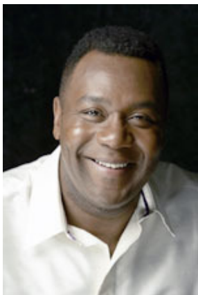
Lenny Henry Comedian and actor

At the moment, I'm going through all the Beatrix Potter books with my son. He loves them just as much as I did.